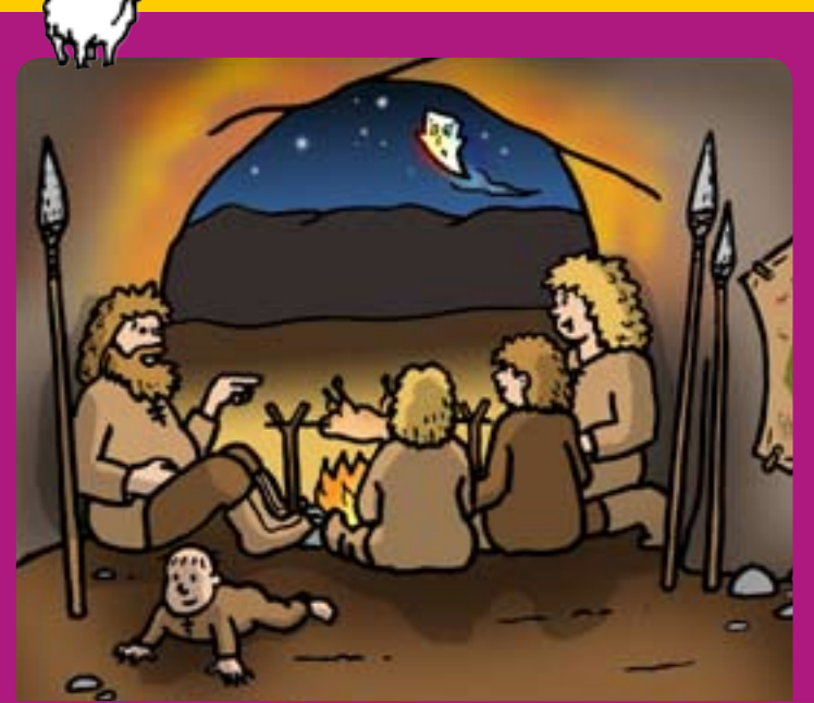
It's dark. The only light Dazzle can see is the glow of a camp fire in a cave.